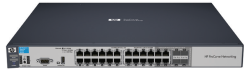
HP 3500-24 Switch (J9470A)