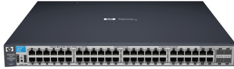
HP 3500-48 Switch (J9472A)